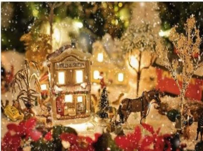
Bonsall Woman's Club's 30th Christmas Fundraiser Thank you to the Committee!