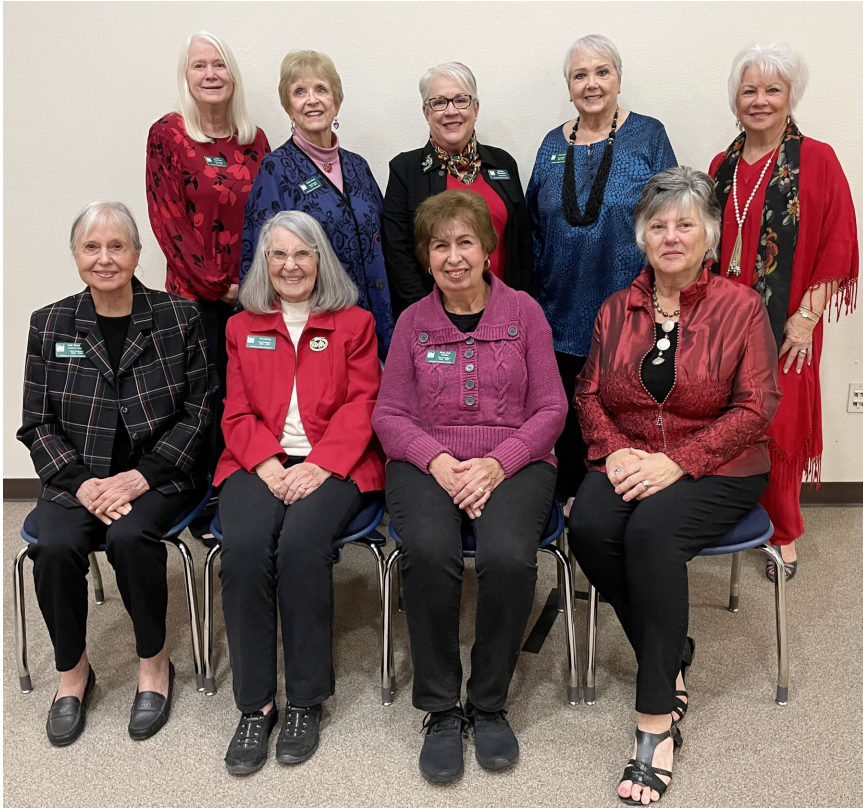
Honoring BWC Past Presidents at club's 43rd Birthday