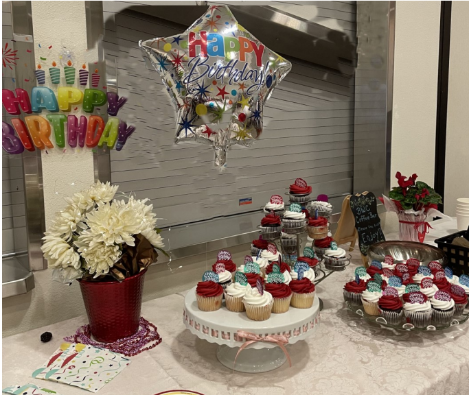
Cupcakes for everyone - 43rd Bonsall Woman's Club Birthday