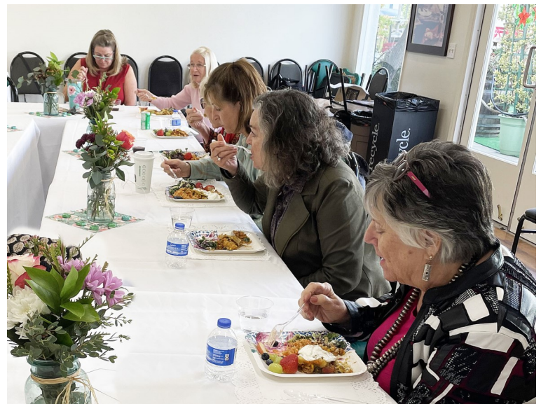
Christmas Committee members enjoying luncheon