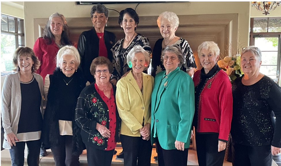
The Angel Society of Fallbrook are welcomed guests at the BWC Holiday Fundraiser