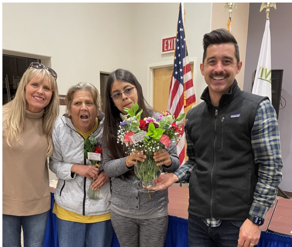
The Fallbrook Hidden Treasures Group donated lovely flower arrangements for our Silent Auction in January and collected the unsold items for their non-profit Thrift Store in Fallbrook