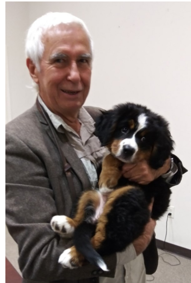
Next Step Service Dogs has a new puppy to train