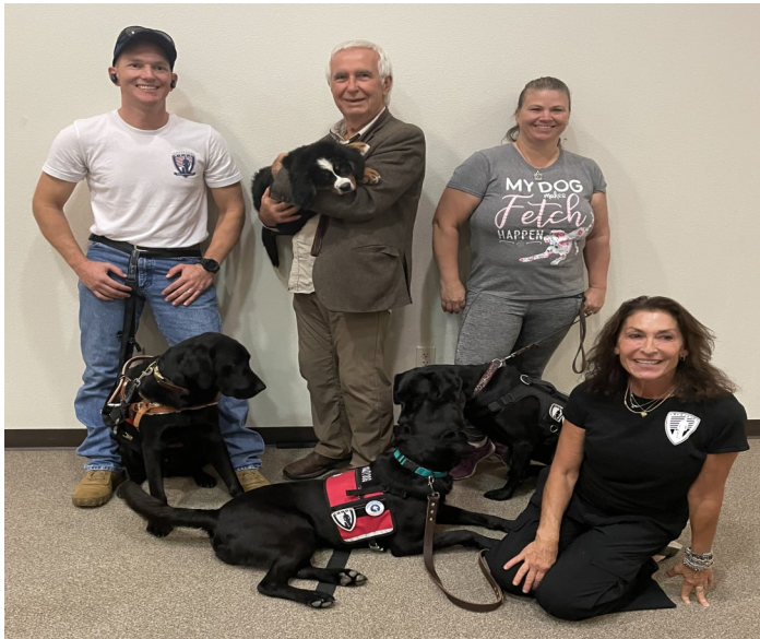
Next Step Service Dogs